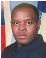
P.O. Sony Clergé Posthumous