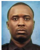
Dalsh Veve Medal of Valor