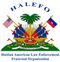
Frantz Jerome Contributor Award