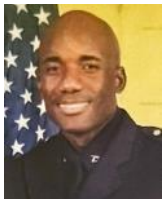
Det Chenet Gedeon Posthumous